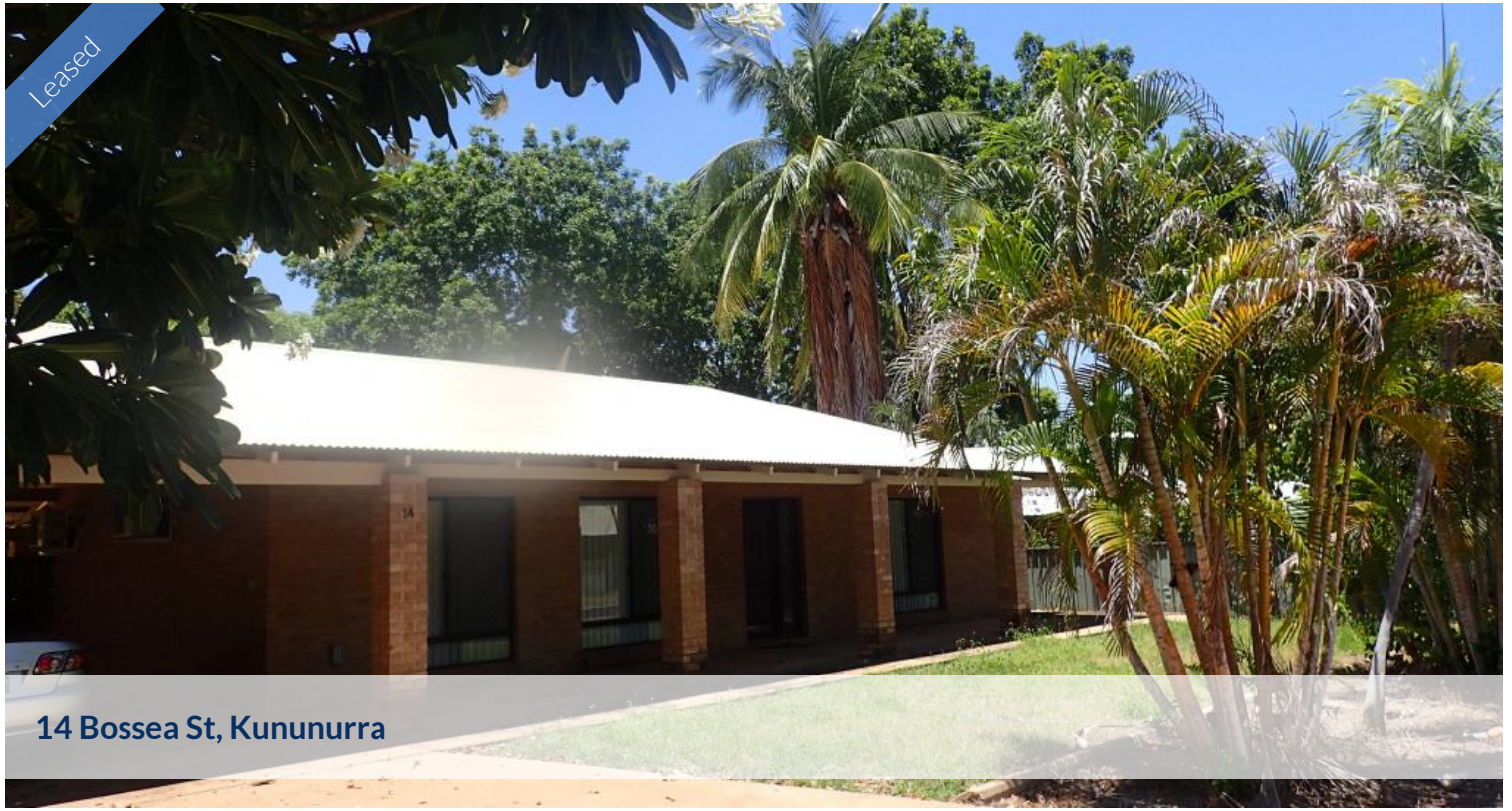
14 Bossea St, Kununurra