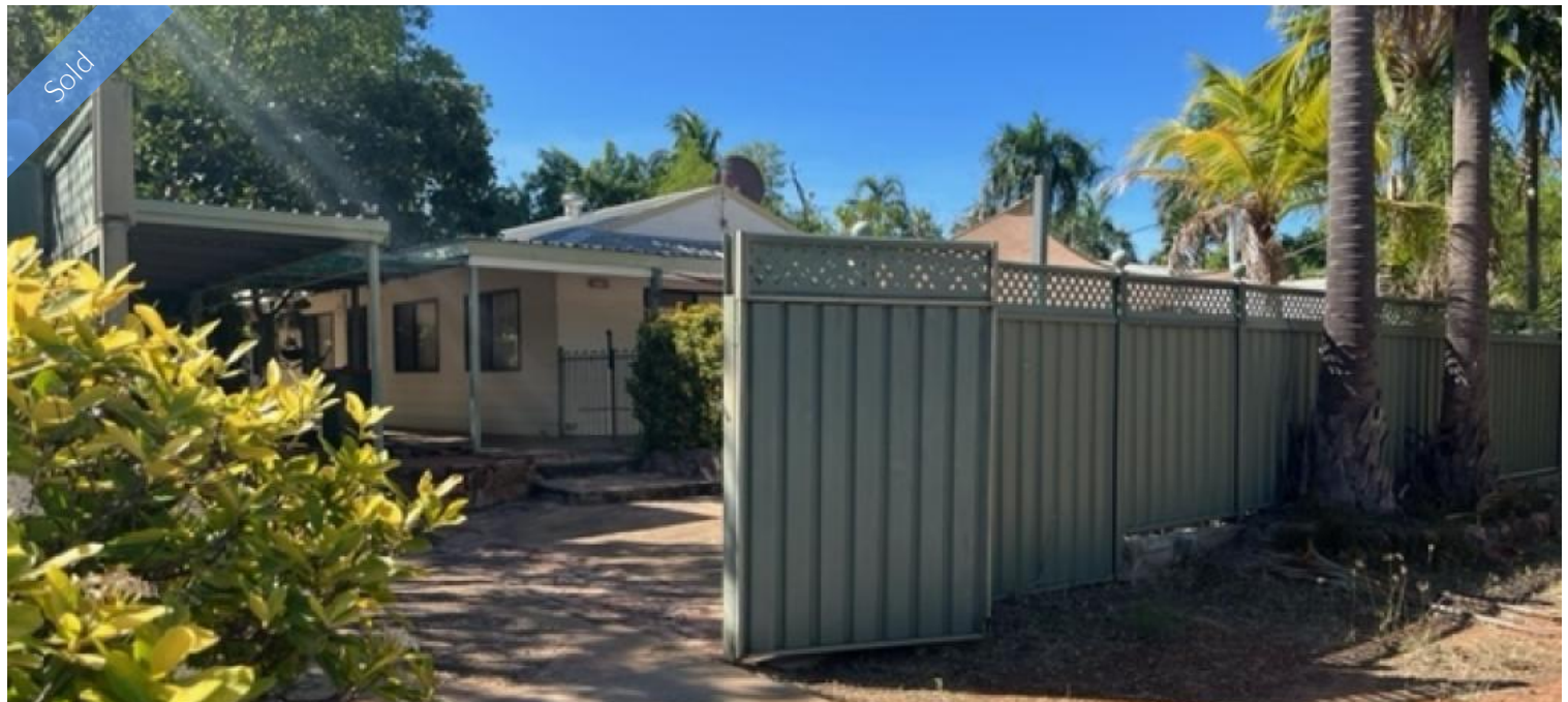
3 Wilga Pl, Kununurra