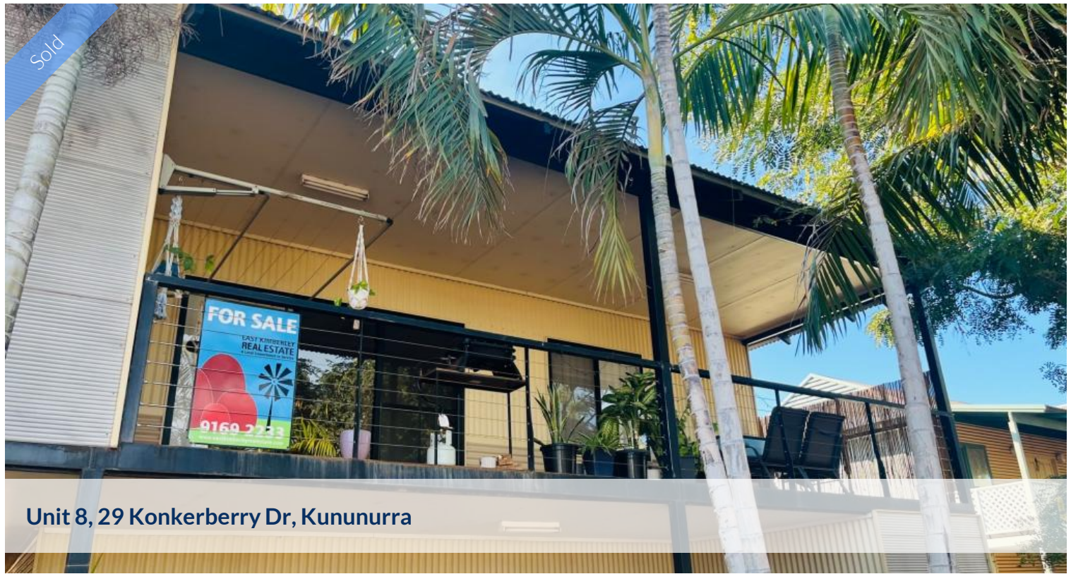
Unit 8, 29 Konkerberry Dr, Kununurra